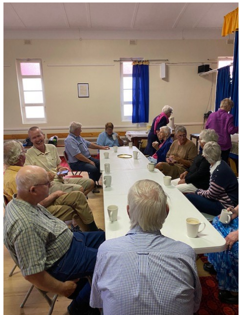
Fellowship after service

We will celebrate the Lord's Supper again on 2 nd March.