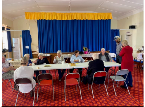
Morning tea at Church